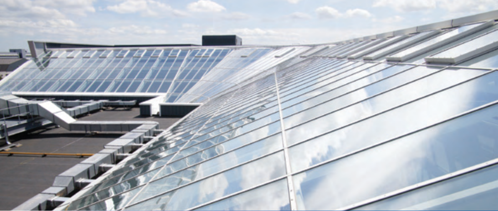
LUMA VENTS IN ROOFGLAZING RED MALL, BLANCHARDSTOWN SC