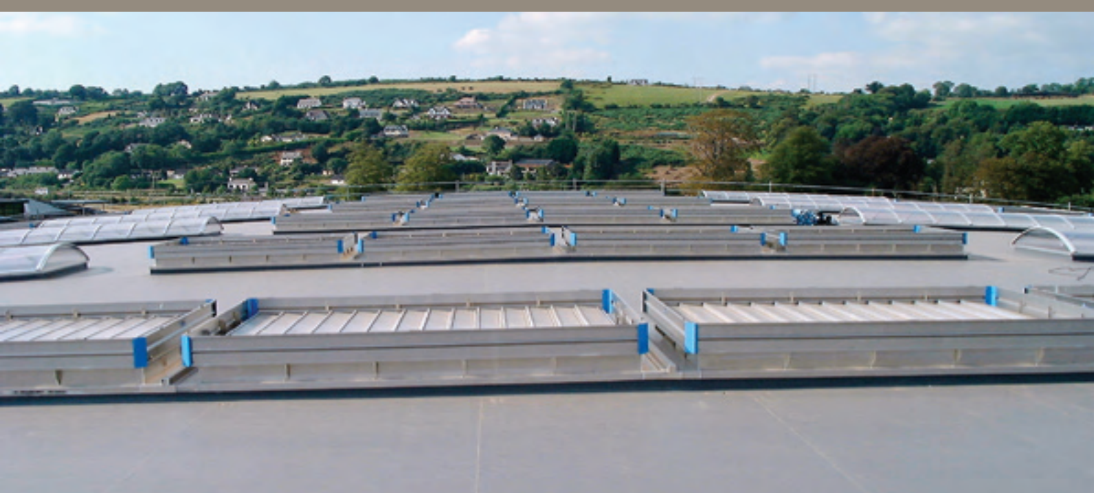
EURA VENTS ON ROOF OF EAST GATE BUSINESS PARK